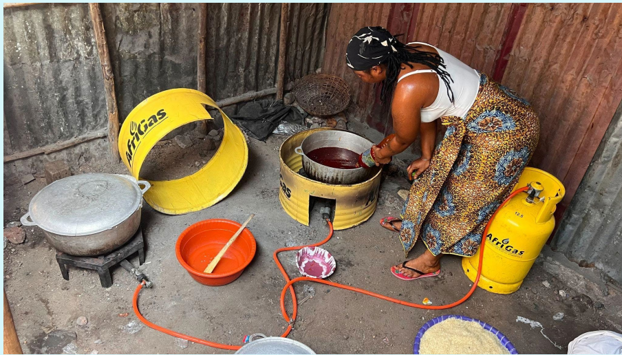
Use of shared canister model by a cooked food vendor in Susan Bay, Freetown. Implemented by Afrigas Sierra Leone through ENACT funding. Photo credit: ICLEI Africa (February 2024).

To amplify the impact, influential members of the community are recruited as “clean cooking champions” and are remunerated for their services. This multifaceted approach showcases how ENACT is not only promoting clean cooking, but also creating economic opportunities and empowering local communities in the process (ICLEI Africa and Clean Cooking Alliance, 2023).