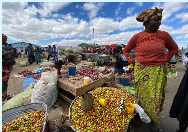
Fresh food trader at Lusaka's largest food market, Soweto Market.

The AfriFOODlinks project, coordinated by ICLEI Africa, emphasises the importance of peri-urban zones and local rural food-sheds over urban agriculture. This shift in focus is based on the understanding that protecting urban edges and ensuring the economic competitiveness of local rural farmers can have a more significant impact on food security and sustainability (ICLEI Africa, 2023). This involves protecting urban edges from development to shield productive agricultural sites from sprawl, ensuring that local food remains economically competitive against global imports through local-first public procurement guidelines, and maintaining local food distribution infrastructures. Moreover, shaping the type of food demand cities place on rural landscapes through advertising regulations, healthy food incentives and taxes on unhealthy foods can significantly enhance urban food environments (ICLEI Africa, 2023).